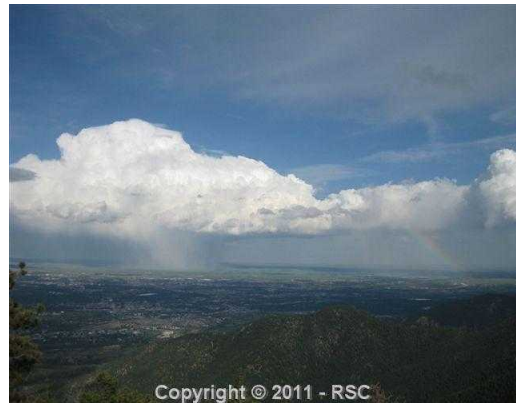
Southern city view