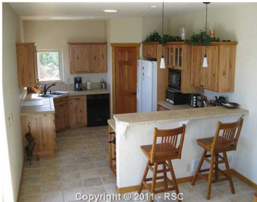
Copyright © 2011 - RSC Kitchen w/ breakfast bar