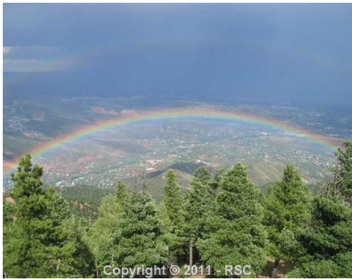
City view with rainbow (a common occurrence)