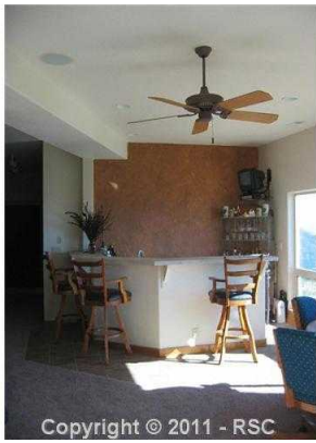
Copyright © 2011 - RSC Recreation room with full wet bar