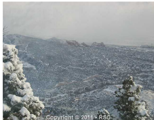
Winter view of Garden of the Gods