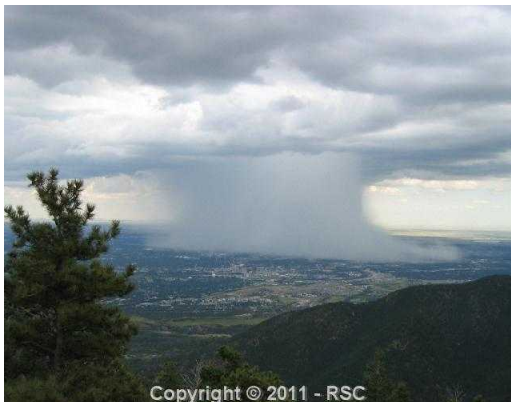
Weather over Colorado Springs