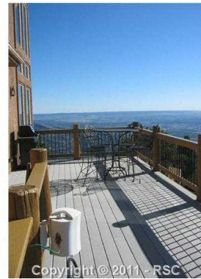
Large deck off of kitchen/dining room and view to the north