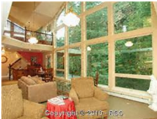
Other end of greatroom with more massive windows letting with gorgeous Colorado scenic greenery in - it's picture perfect!