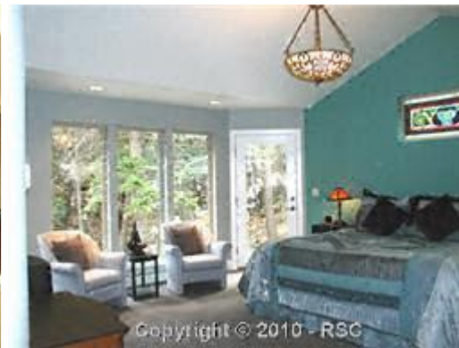
The upper level is a true master suite (1129 sq. ft.) with a lovely master bedroom with a bayed wall-of-glass, gas log fireplace, private deck, walk-in closet, his & hers baths, cozy reading nook & a library.