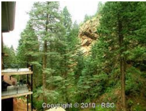
The main level opens to a 15 x 12 covered cement deck with iron railings, mood lighting & exterior speakers. The library & loft lead out to a 15 x 12 cement deck with iron railings overlooking the waterfalls & the creek right below.