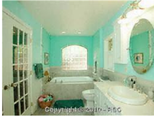
Master bath with built-in shower, 2 commodes, furniture sink on one side & pedestal sink at other end of bath, soaking tub, French glass doors & acrylic block windows. His & hers are separated by door. This photo shows her side of bath.