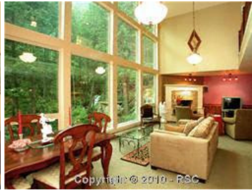
2 story greatroom with a floor-to-ceiling wall of glass looking right out at creek, waterfalls & rock formations. 100 year old church railing wainscoting & custom entertainment center. Imported fireplace from Sweden with an antique mantle.