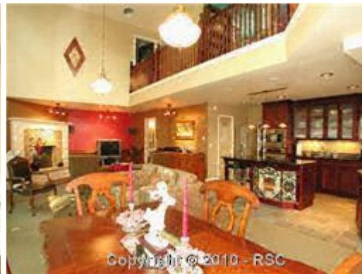
Hanging solid brass antique globe lighting in open dining & living areas.