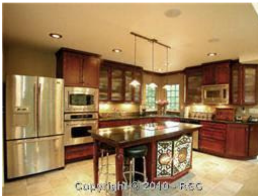
Gourmet island kitchen (open to the greatroom ) slab granite counters, ebony cherry cabinets with bistro glass fronts, custom crown molding & backsplash, top-of-the-line stainless steel appliances, tile floor & large walk-in pantry.