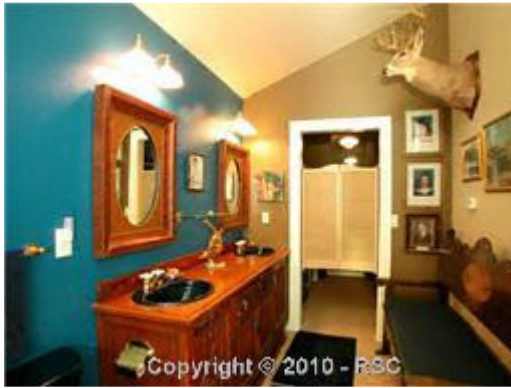
2nd master bath off 2nd master suite (office) with huge shower with solid glass door, 2 showerheads & built-in tile bench, double sinks & large walk-in closet.