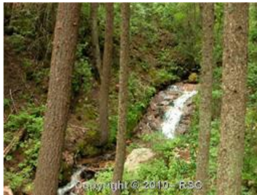
The crisp rushing creek below - very refreshing!

Information herein deemed reliable but not guaranteed. Copyright: 2010 by Pikes Peak REALTOR® Services Corp. Tue, May 11, 2010 01:02 PM