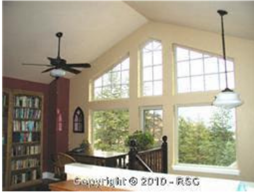
library with 2 story wall-of-windows looking out at the city below. Brazilian cherry wood flooring in library & loft lead out to a 15 x 12 cement deck with iron railings overlooking the waterfalls & the creek right below.