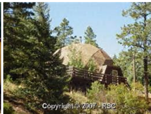
From bottom of driveway