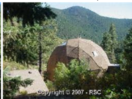
Back of house and Garage