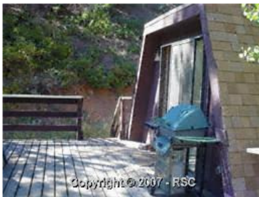
Wrap around Deck

Information herein deemed reliable but not guaranteed. Copyright: 2008 by Pikes Peak REALTOR® Services Corp. Tue, Mar 25, 2008 10:23 AM