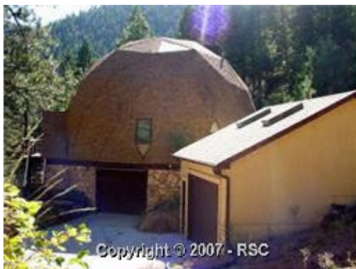
House and Detached Garage