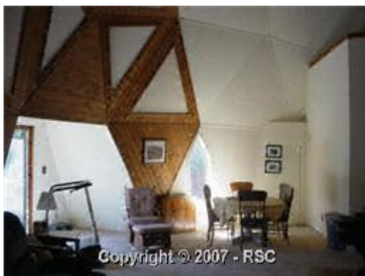
Living Room and Dining Area