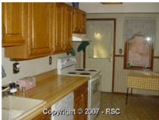
Walkout Galley Kitchen